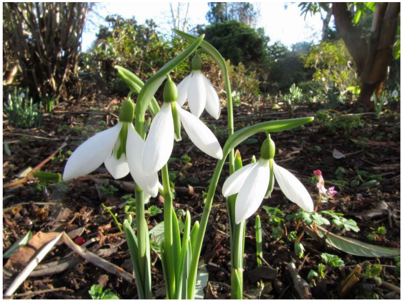
Many forms of Galanthus are now standing tall waiting for a wee bit of warmth to open their flowers.