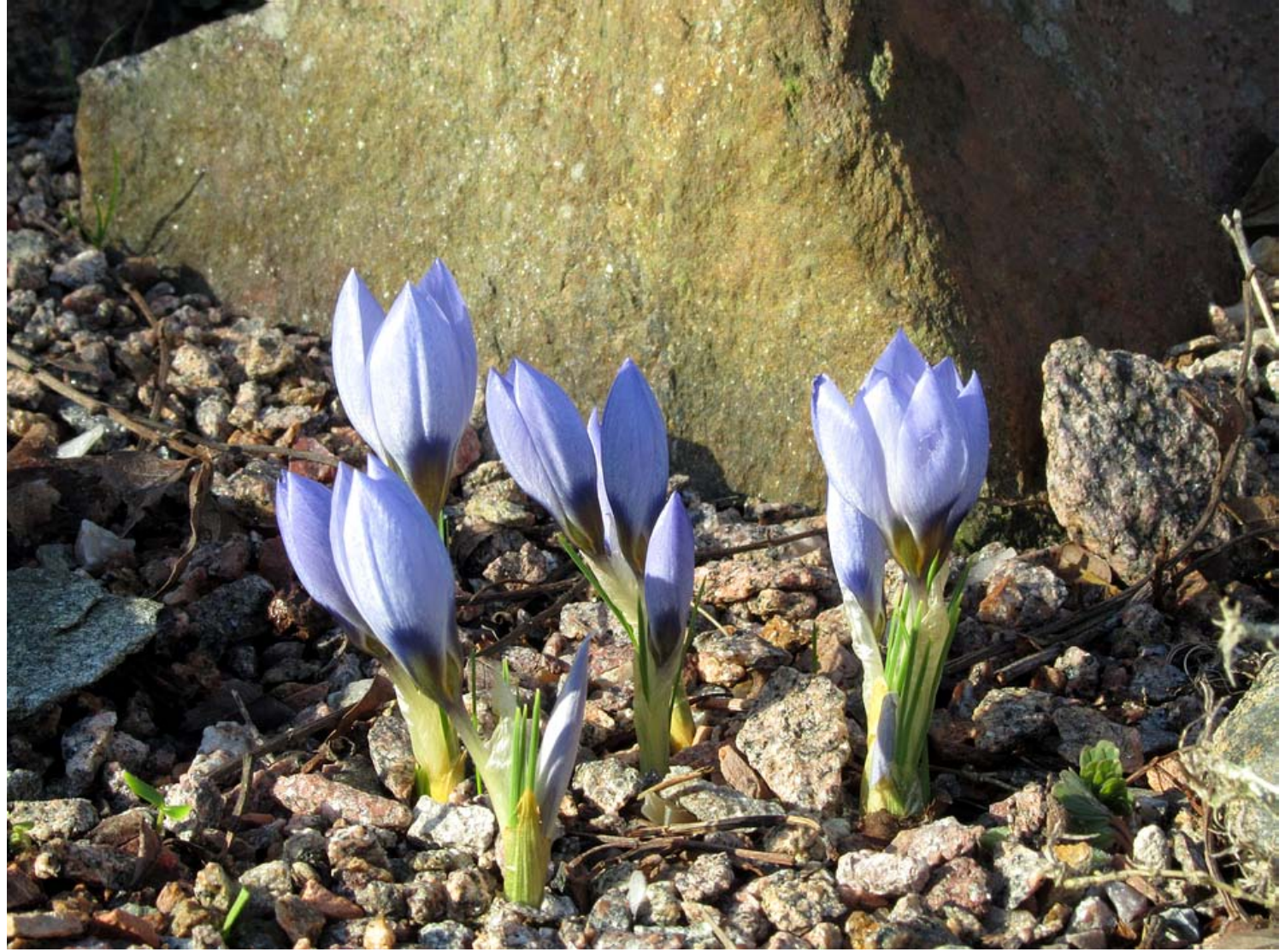
Moving back outside for this week's final image you will see Crocus abantensis in a raised slab bed just thinking of opening if the temperature would just rise a wee bit more......