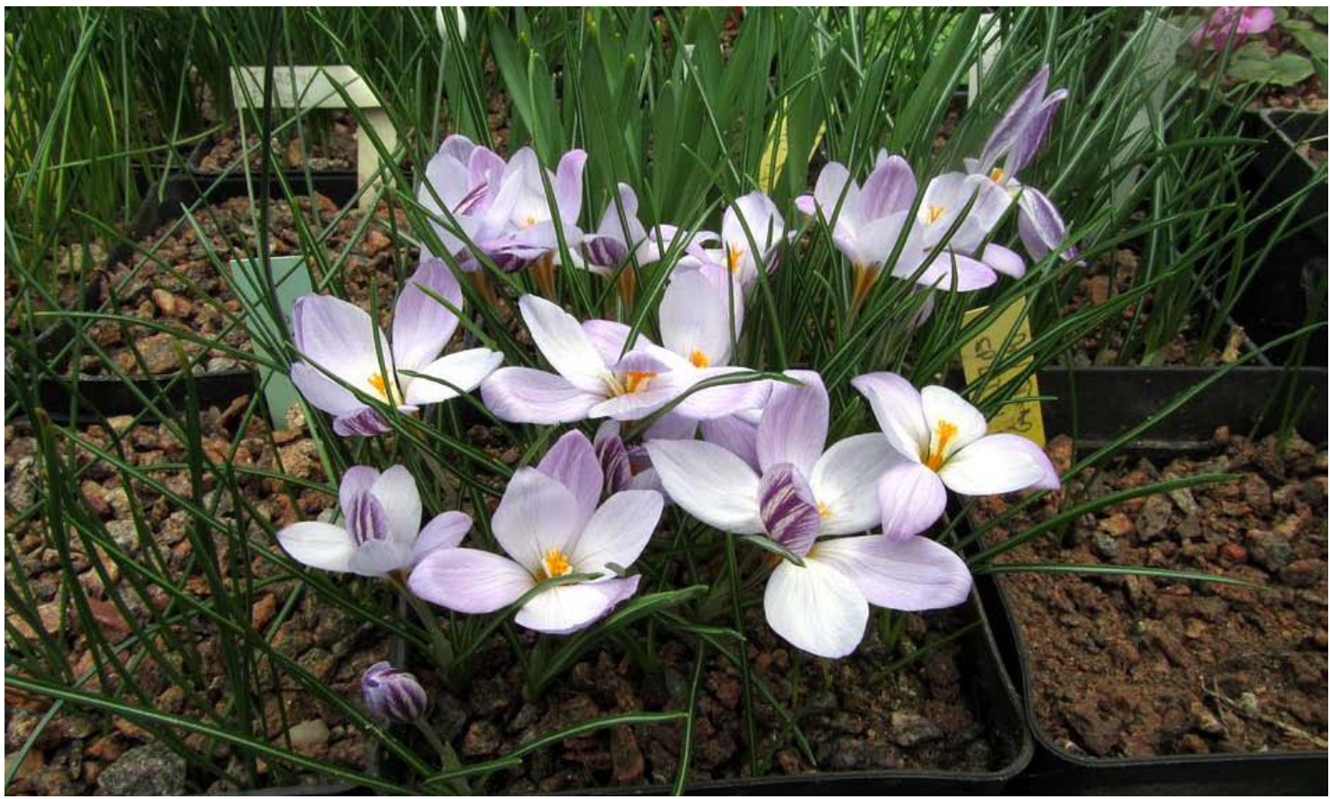
Another pot of Crocus laevigatus comes into peak flowering on a sunny day.