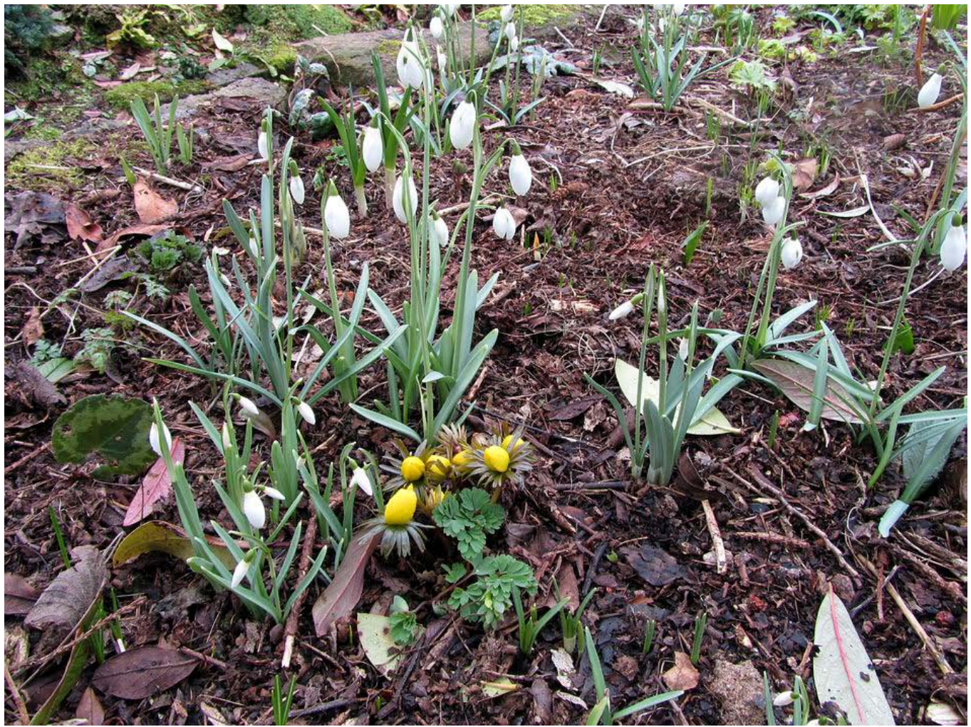
A clump of Eranthis 'Guinea Gold' emerges at the base of some Galanthus showing what good companions these early flowering bulbous plants are in the open garden beds.