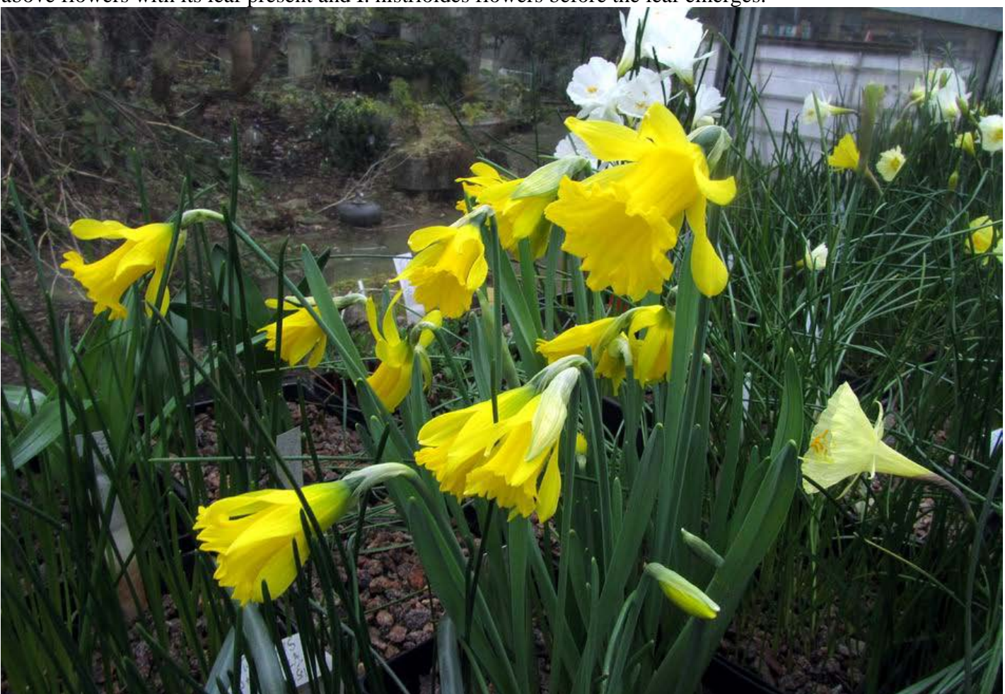
Narcissus perez-chiscanoi x N. cyclamineus

Narcissus asturiensis flowering here next to a pot of Iris histrio. Last week I showed a similar Iris growing outside which I captioned Iris histrio but should have called it Iris histrioides they are very similar to look at but I. histrio above flowers with its leaf present and I. histrioides flowers before the leaf emerges.