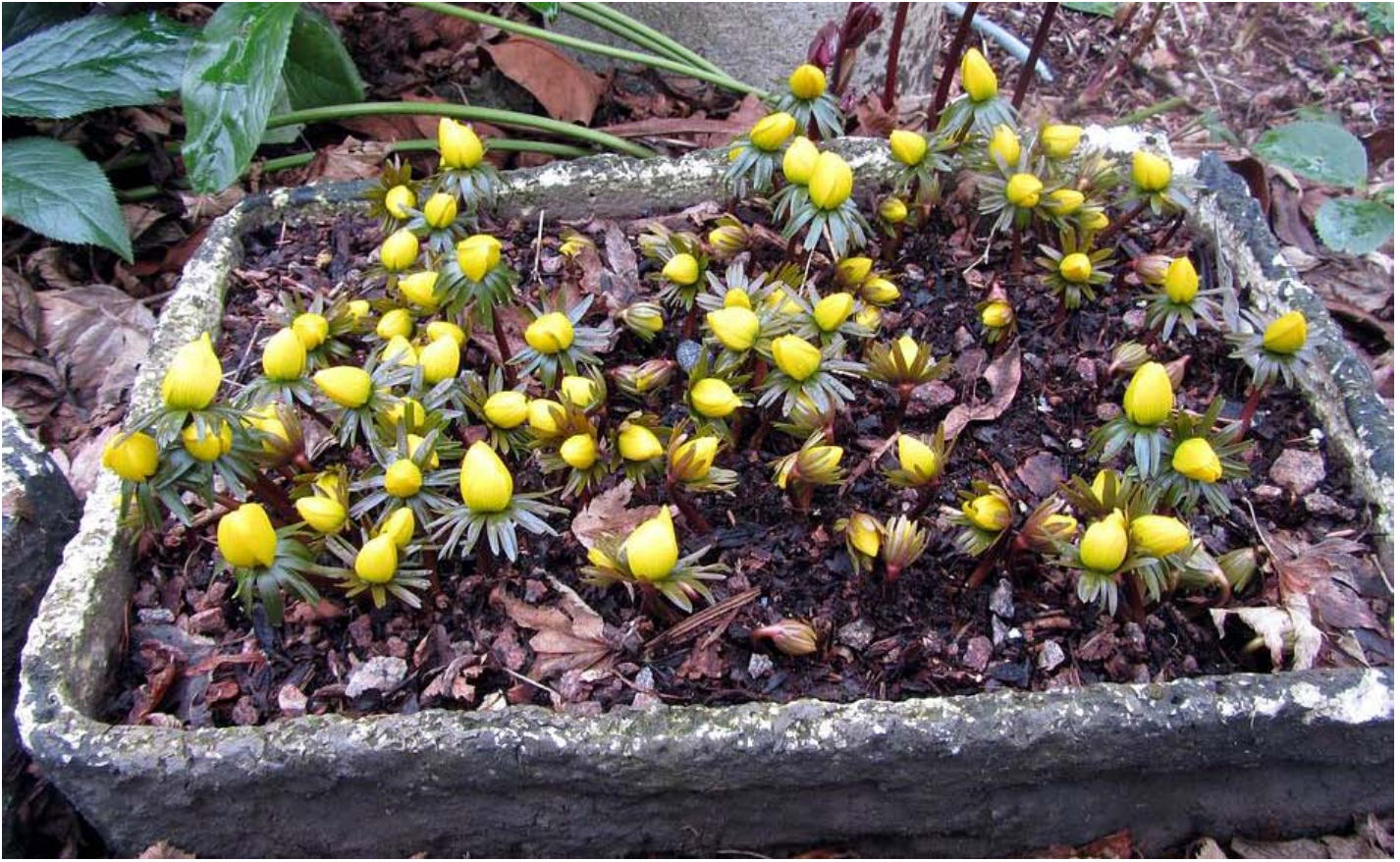
Here a group of 'Guinea Gold' is growing in a fish box trough which makes it easy for me to replant them every year into fresh humus rich compost which helps speed up the rate the tubers divide to increase my stocks.

Eranthis 'Guinea Gold' The stems of Eranthis 'Guinea Gold' are also pushing through the ground now – the group above is in one of the raised slab beds.