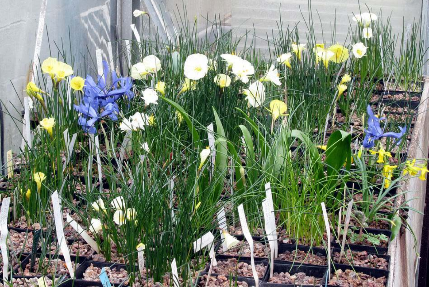
The later flowering has resulted in many of the Narcissus flowering on short stems much more in keeping with their scale than the ungainly etiolated stems we have had when they flower in the dark days of winter.