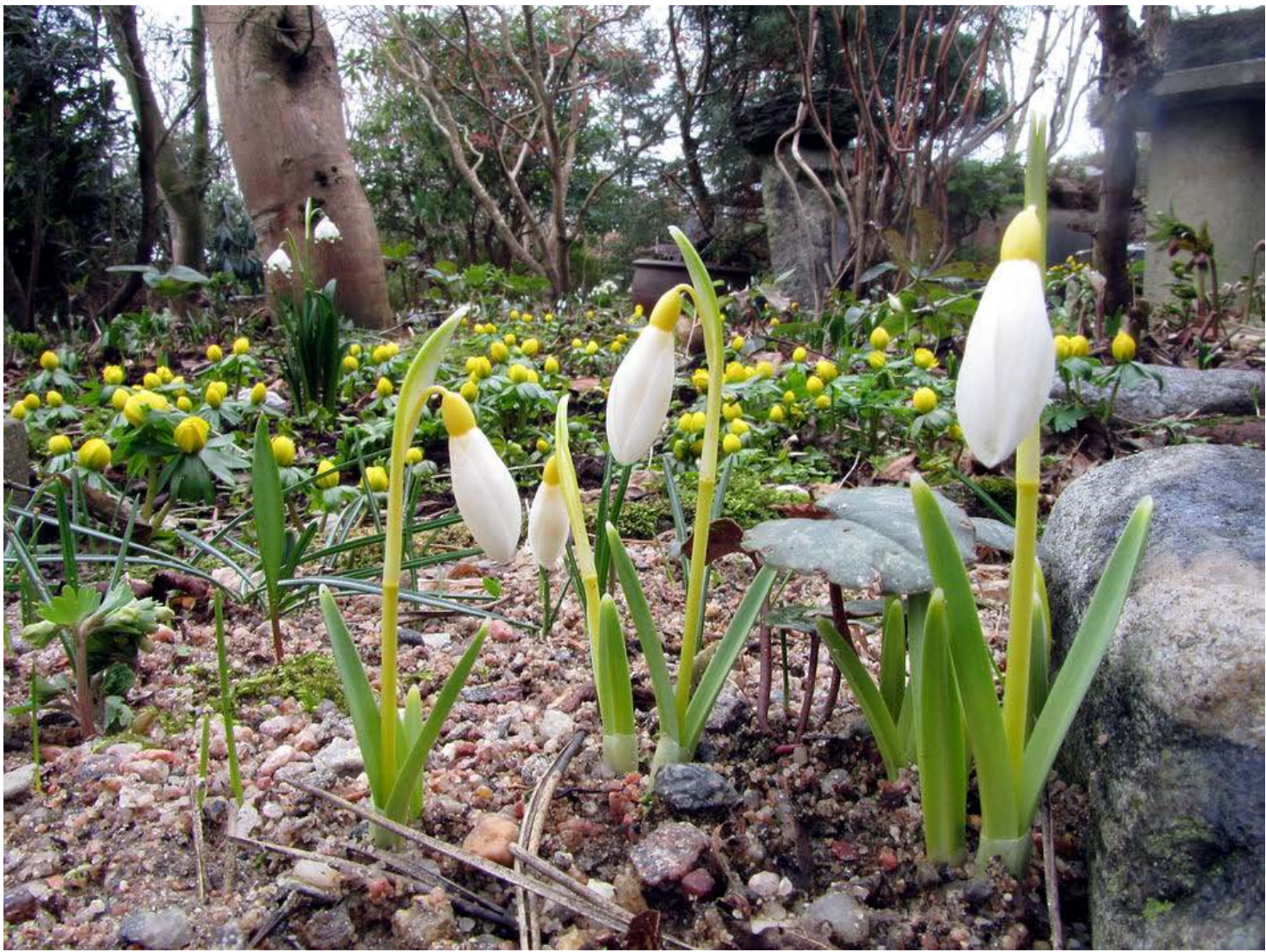
Some yellow forms of the Sandersonii group are doing very well in one of the "sharp sand bulb beds" – set off as these are by a backdrop of Eranthis in the bed beyond.