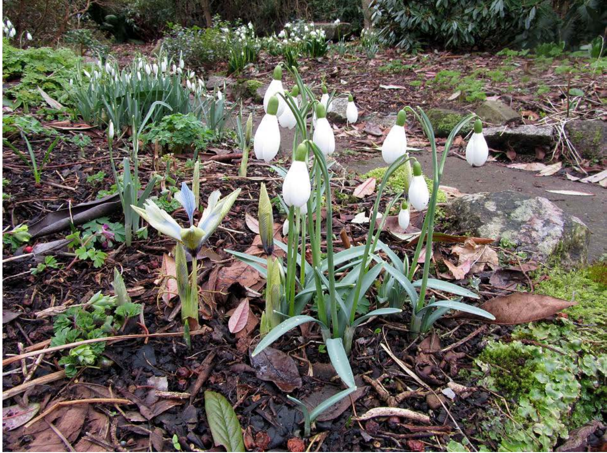
Another companion of the Galanthus is this Iris 'Katharine Hodgkin' just about to spring open.