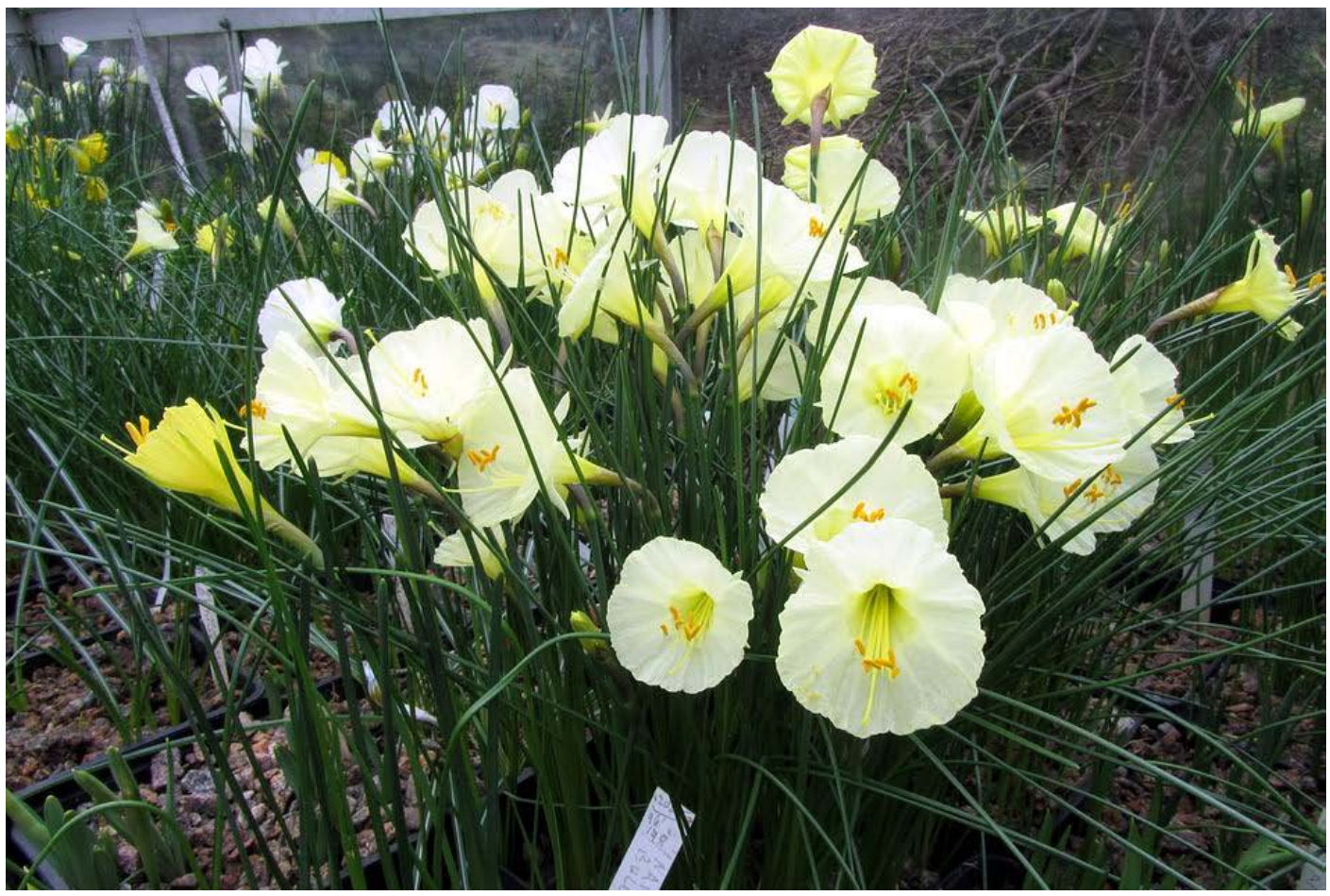
Narcissus 'Craigton Clumper'