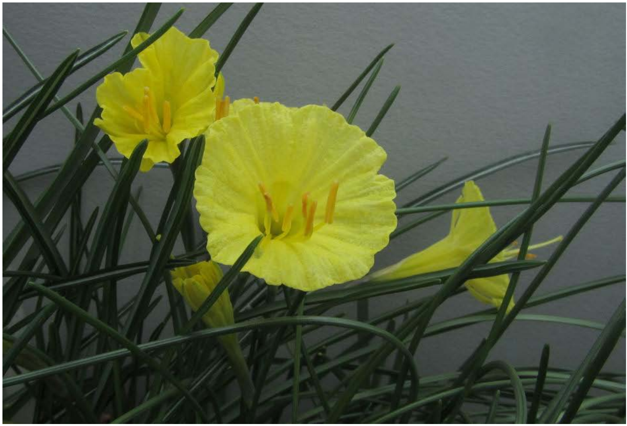
Narcissus 'Atlas Gold'