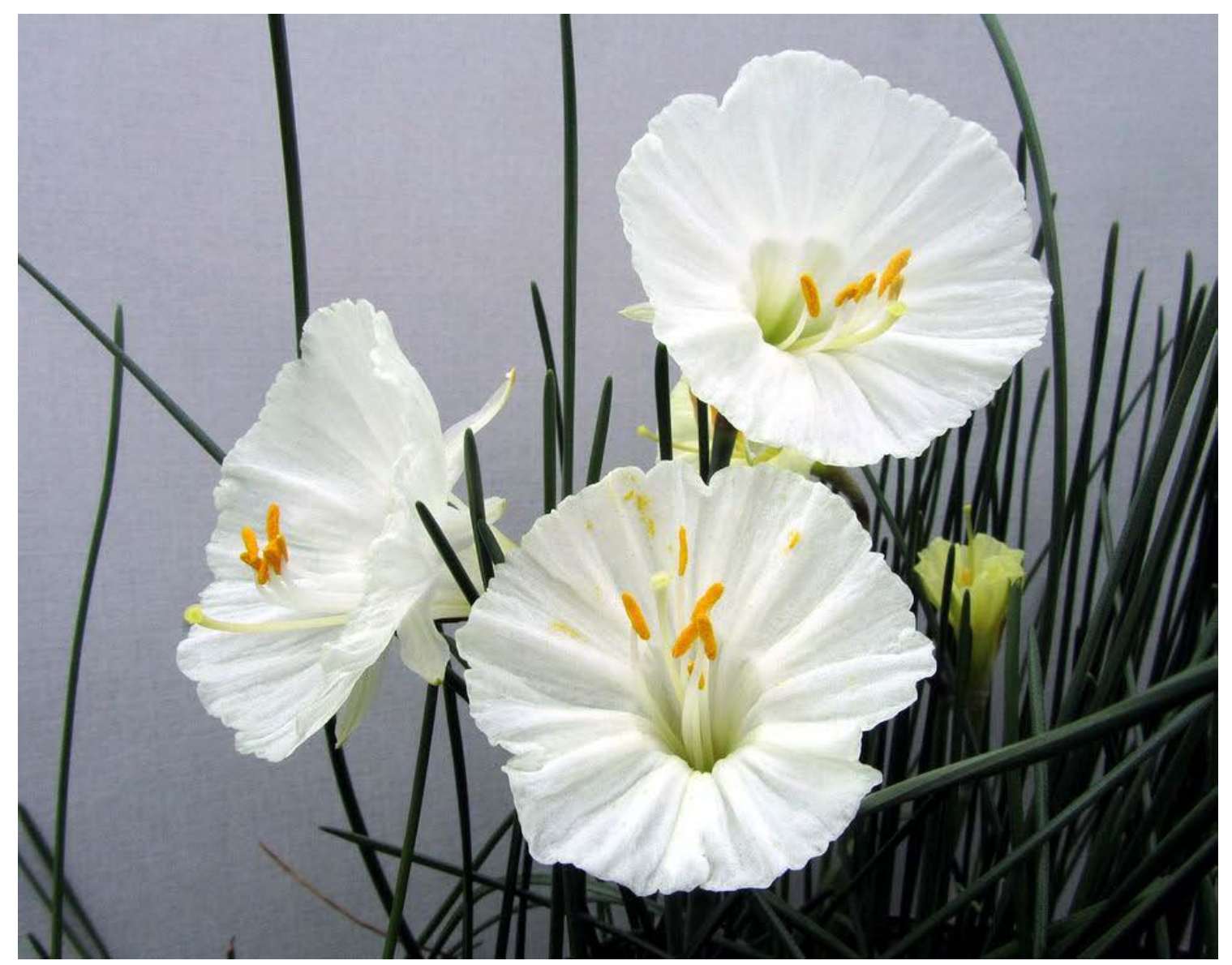
Select seedling ex Narcissus 'Camoro'